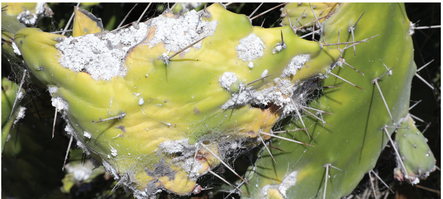
Cochineal taking effect on drooping tree pear cladode

Read the label and permit carefully before use and always use the herbicide in accordance with the directions on the label.