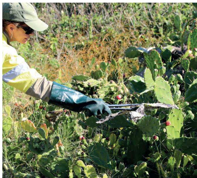
Placing an infected cladode on drooping tree pear

Once established on individual plants, the adults provide a continuous supply of new insects to attack new growth and surrounding plants. Cochineal insects are wind-borne and spread to new plants, relies on individuals landing on suitable plants. However, control and spread can be enhanced if the cochineal is manually transferred to new plants (see below).