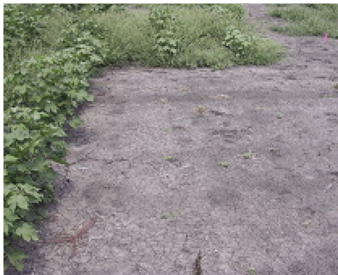
Image 2: Cowvine Control Control of barnyard grass (6 - 8 tillers), glyphosate tolerant volunteers (Cotyledon and 6 - 8 leaves), and red pigweed (10 - 20cm diameter) with Glyphosate at 1.2L/ha and Bromicide 200 at 1.5L/ha