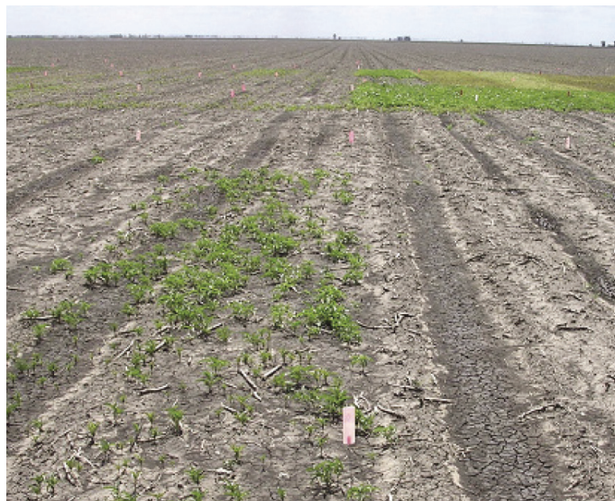
Image 1: Barnyard Grass Control Cowvine control 25 days after application Left: Glyphosate at 1.0L/ha Right: Glyphosate + Bromicide 200 at 1.0 + 1.5L/ha